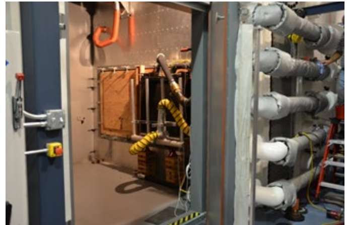
AFL Calorimeter Test