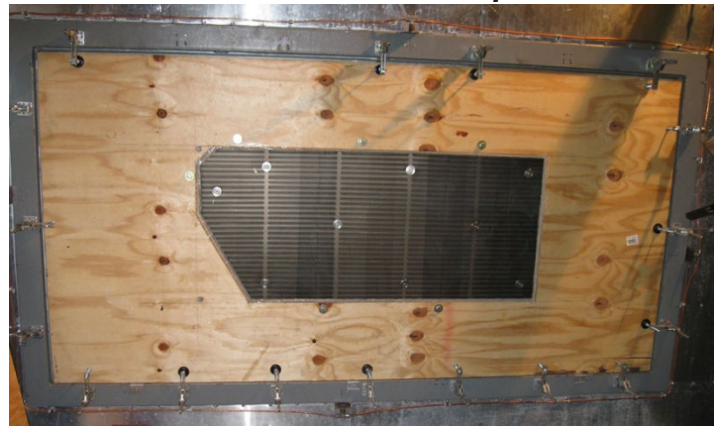
Ballistic Grille Test Setup