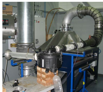
2,000 CFM Test Setup