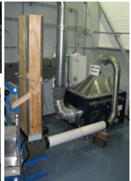
2,000 CFM Test Setup