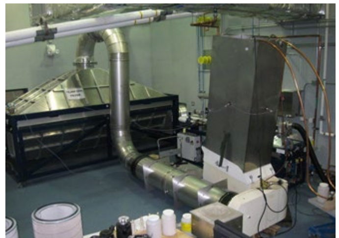
AFL Filtration Test