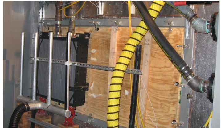
Radiator Test Setup